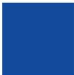
Blue - PMS 293

Four-color process: Cyan 100% Magenta 56% Yellow 0% Black 0%