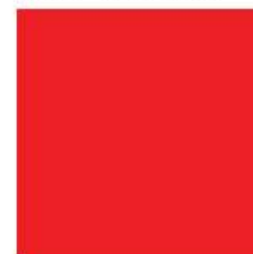
Red - PMS 485

Four-color process: Cyan 0% Magenta 100% Yellow 91% Black 0%