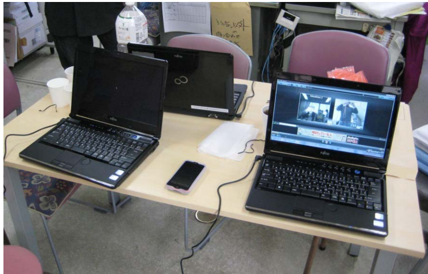
↑ Donated PCs

Relief supplies to Miyagi Regional Headquarters